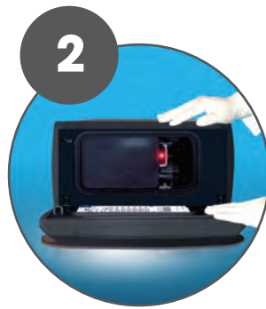
Place FastPack ® into FastPack ® IP Instrument